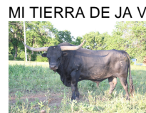
MI TIERRA DE JA VU