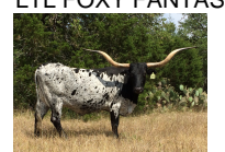
LTL FOXY FANTASY