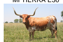
MI TIERRA E30