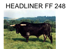
HEADLINER FF 248