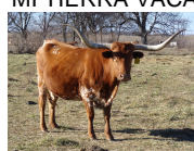
MI TIERRA VACA 76