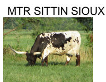
MTR SITTIN SIOUX